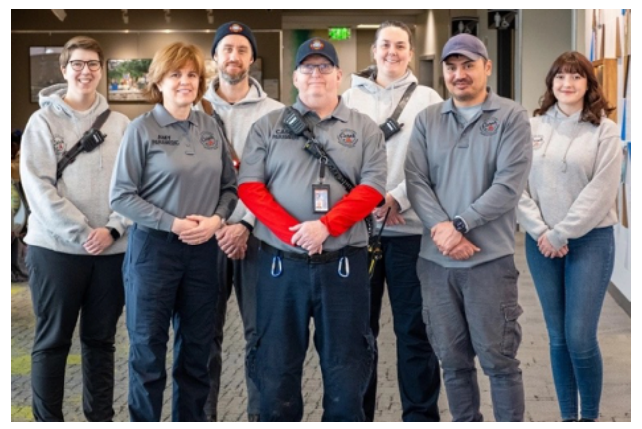
CARES teams are comprised of Madison Fire Department community paramedics and Journey Mental Health crisis workers.